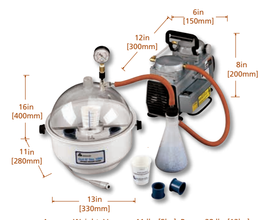
Approx. Weight: Vacuum: 11 lbs [5kg]; Pump: 28 lbs [13kg]