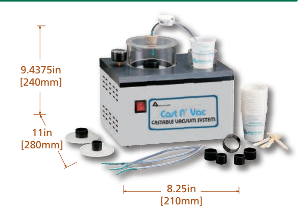
Approx. Weight: 15 lbs [6.8kg]